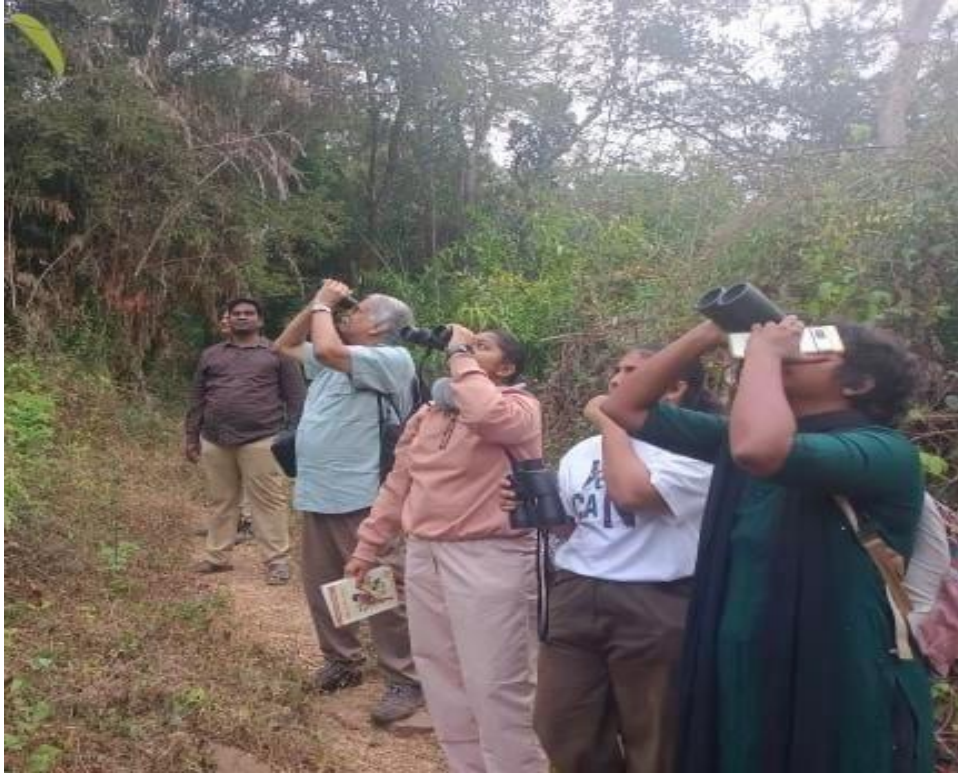
On the spot viewing birds in the forest