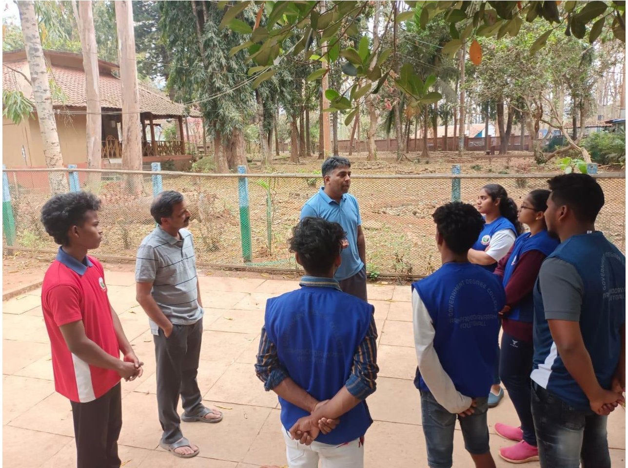
Senior bird viewer interacting with students