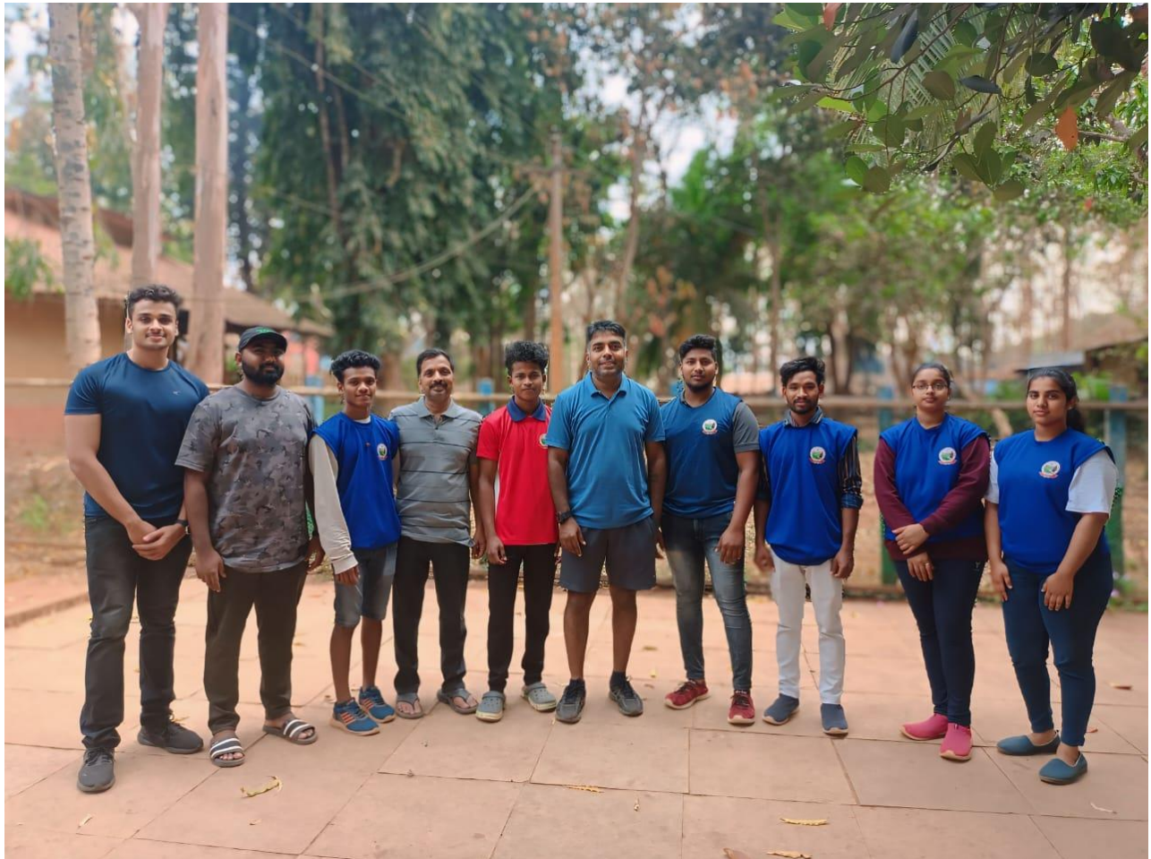
Students with other bird viewers