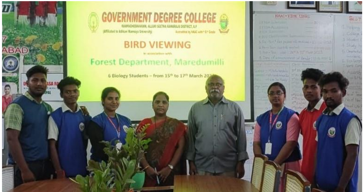
Students along with Principal and the Mentor