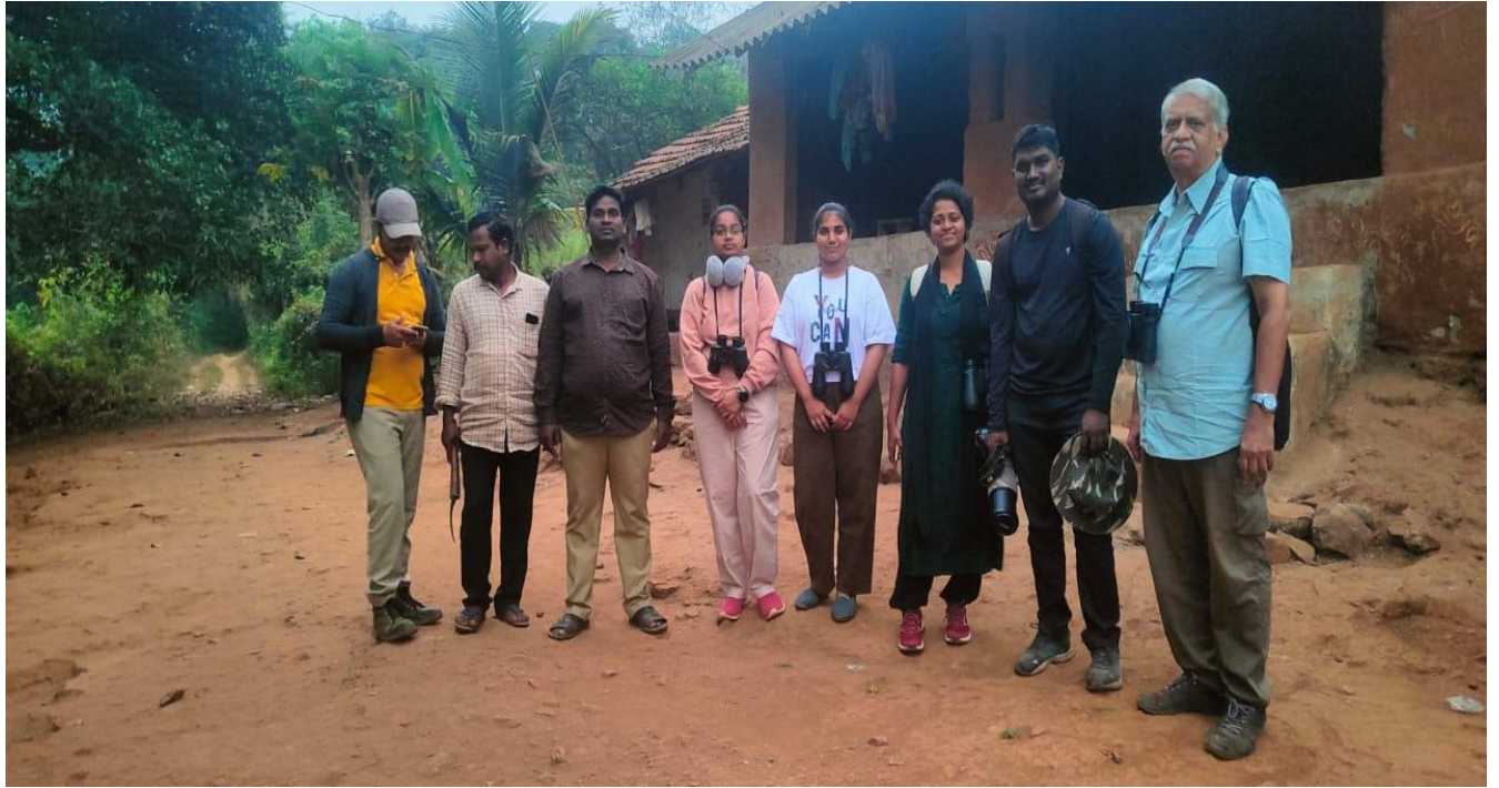
Before going into the deep forest the team